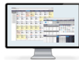
iPECS Attendant (PC)