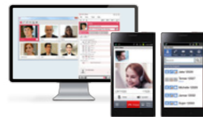
iPECS UCS Client (PC & Mobile)