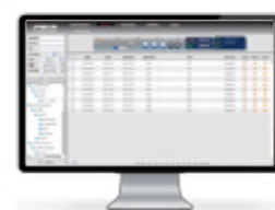
iPECS IPCR (PC)