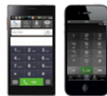
iPECS Communicator on Android or iOS